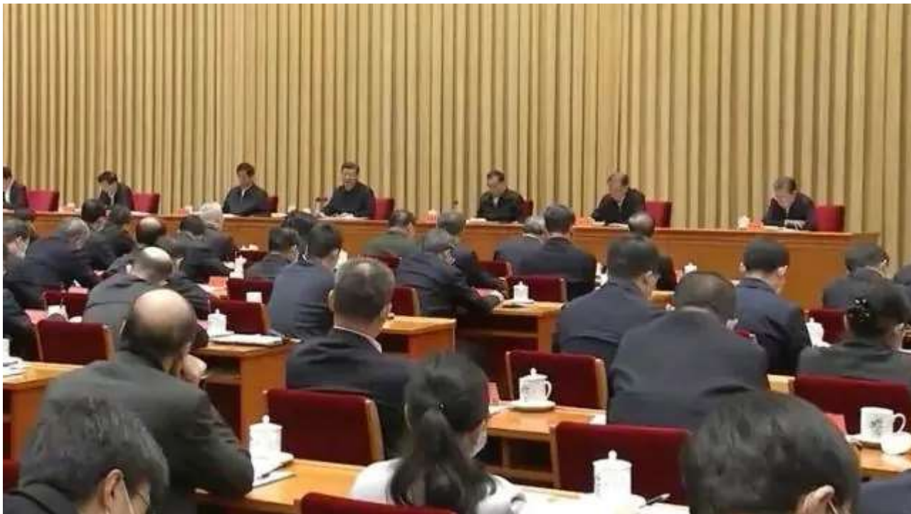
An image of the conference.

On December 3 and 4, the Chinese Communist Party held in Beijing a National Conference on Work Related to Religious Affairs. It was the first such conference since 2016, not an auspicious recurrence for